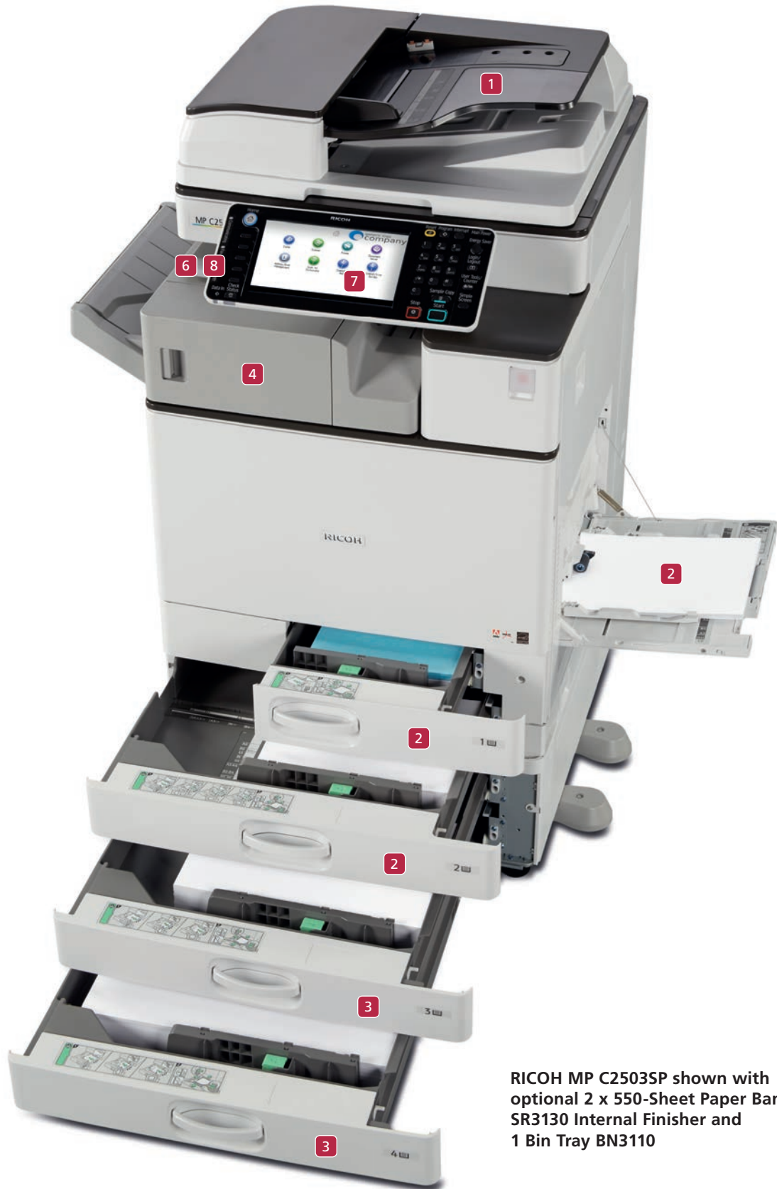
RICOH MP C2503SP shown with optional 2 x 550-Sheet Paper Bank, SR3130 Internal Finisher and 1 Bin Tray BN3110